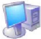
Image creation and queuing system (ENVOY)